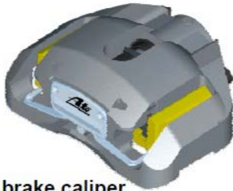
FNR brake caliper constructed of aluminum

Highly developed brake fluids for state-of-the-art hydraulic and electronic brake systems